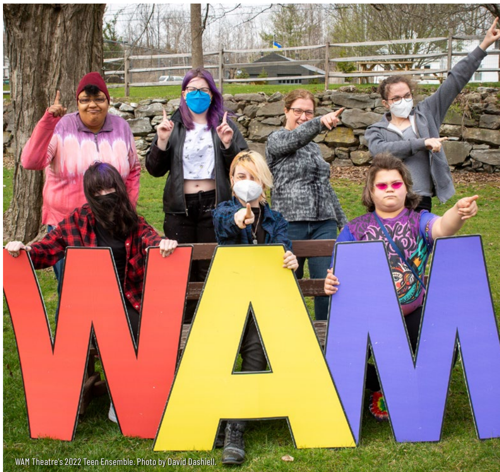
WAM Theatre's 2022 Teen Ensemble.