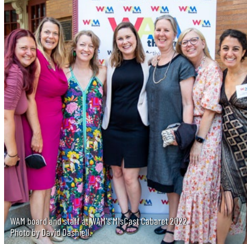
WAM board and staff at WAM's MISCast Cabaret 2022.