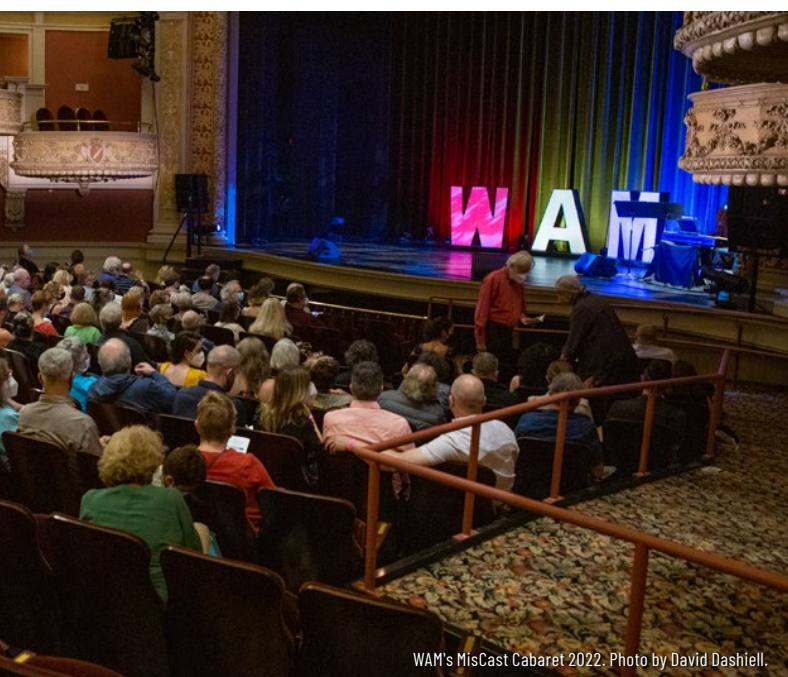
WAM's MisCast Cabaret 2022.