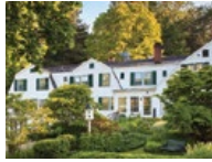
An Historic Bed & Breakfast Inn And Orchard In The Berkshire Hills Of Western Massachusetts.